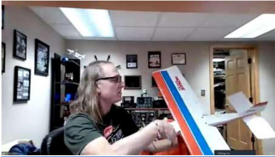
Brians Mini Stick