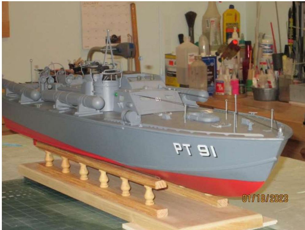
Seven weeks of sanding and filing. Glassed the hull and deck, lots of handmade details, such as guns, railings, hatches, turret cages, hinges etc. Was the most difficult build I ever did. I hope this isn't the future of r/c aircraft !!. mjm