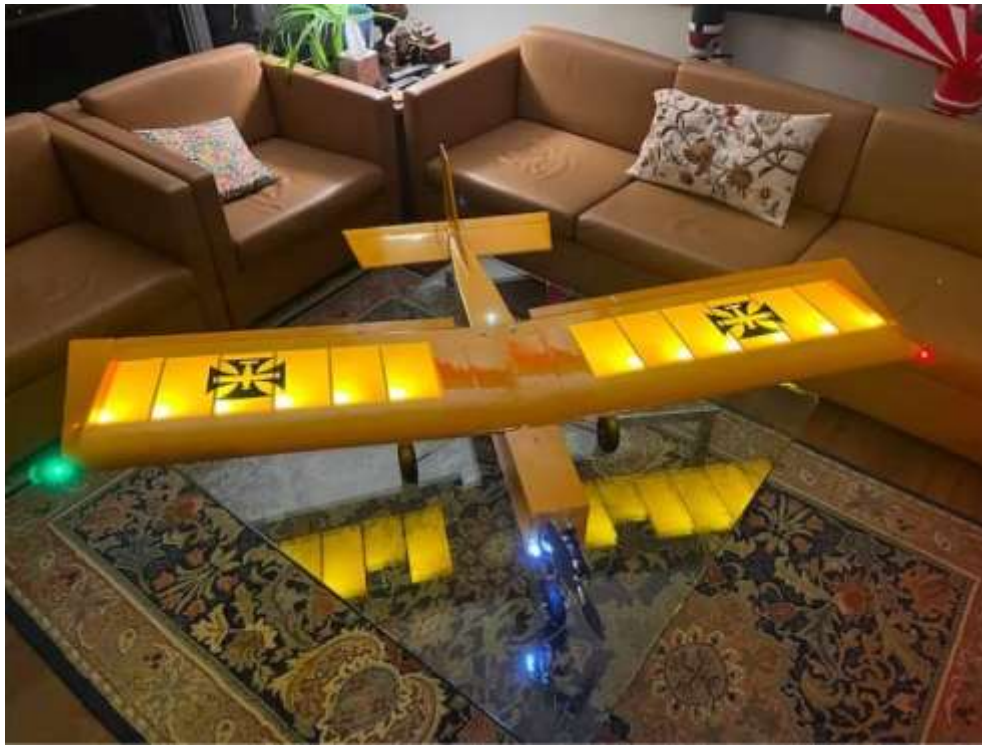
Jim Acklesons rebuilt Ugly Stick with LED lights