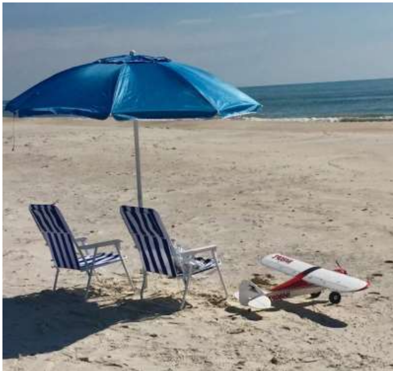
77, winds calm...skies clear... Life is good – Pete