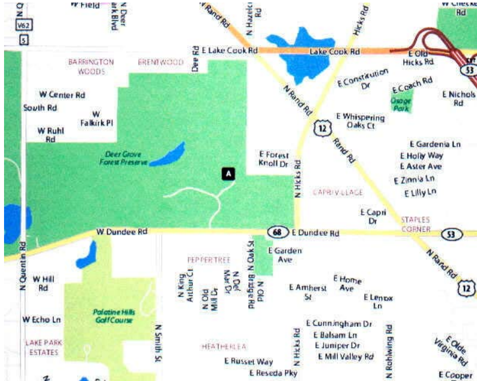
BLUE MAX FLYING FIELD AT DEER GROVE EAST FOREST PRESERVE (ENTRANCE OFF DUNDEE RD)

Blue Max R/C PO Box 7803 Buffalo Grove IL 60089-7803