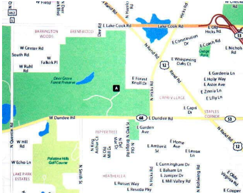
BLUE MAX FLYING FIELD AT DEER GROVE EAST FOREST PRESERVE (ENTRANCE OFF DUNDEE RD)

Blue Max R/C PO Box 7803 Buffalo Grove IL 60089-7803